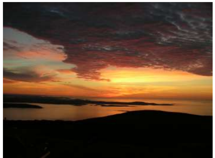
Another amazing sunrise from Cadillac Mountain