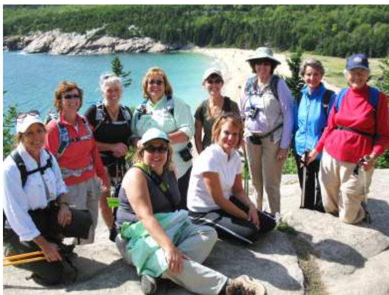
Overlooking Sand Beach from Great Head Peninsula

*No wonder hikers named Acadia one of their 3 favorite national parks in Backpacker magazine!*