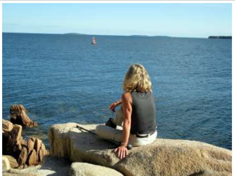
Falling in love with Maine...

(You may request a roommate, or we'll be happy to pair you With one of the other great women traveling solo.)