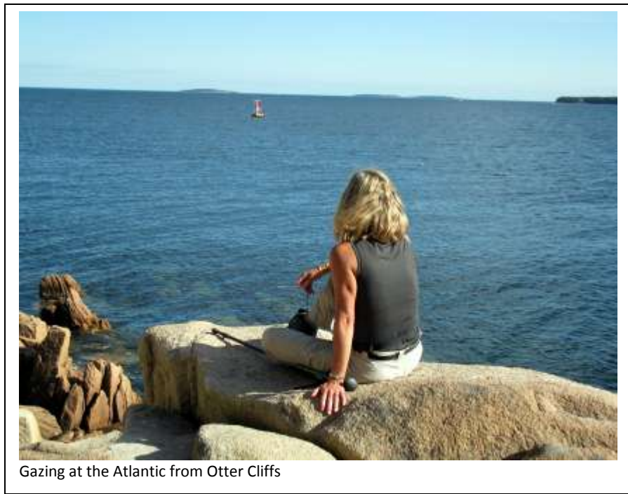
Gazing at the Atlantic from Otter Cliffs

Listen to waves crashing against pink-granite cliffs...the call of loons and gulls...clanging sea buoys...shells crunching as you cross the ocean floor, at low tide, to a deserted island.