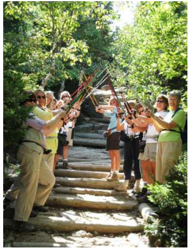
Celebrating a great hike by passing under the hiking-stick salute.