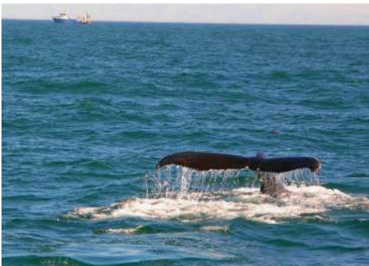
The thrill of whale watching outside of Bar Harbor