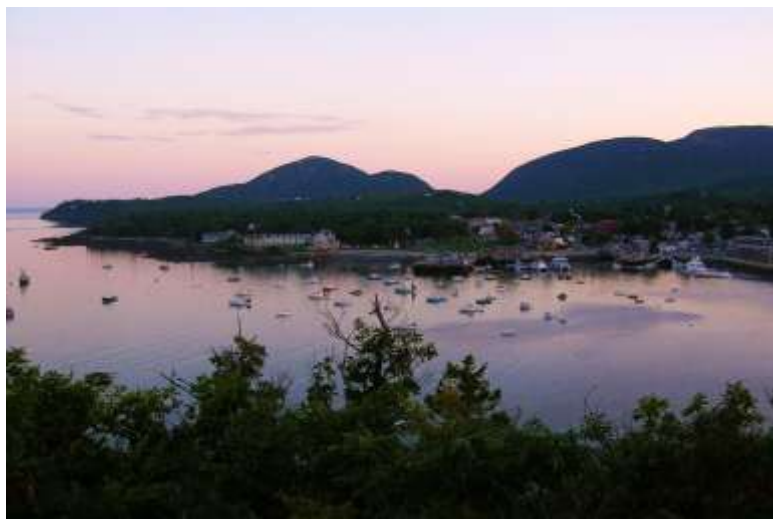
Pretty Bar Harbor from our hike across the bay to secluded Bar Island