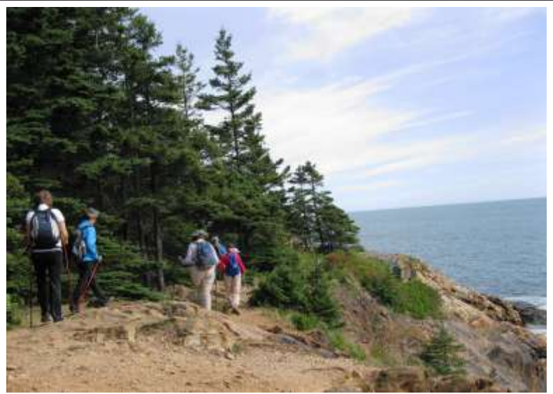
Hiking the lovely, rugged coastline near Ship Harbor.

Cherish one last sunrise over Frenchman Bay. Then let Us shuttle you to the Bangor Airport. Return home with amazing memories and stories, new confidence, warm new friendships, and a renewed love for the great outdoors and this beautiful country of ours.