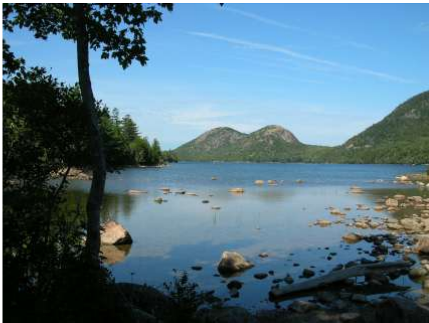
View of the "Bubbles" from Jordan Pond House