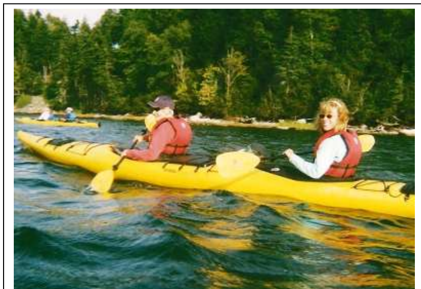
Ocean kayaking among harbor seals on the quiet side of the island.

Dine together at one of Bar Harbor's great restaurants.