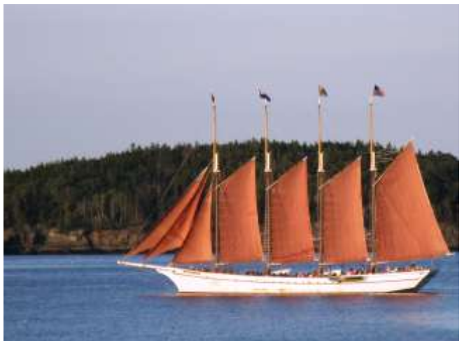
Sunset- sail aboard the Margaret Todd schooner