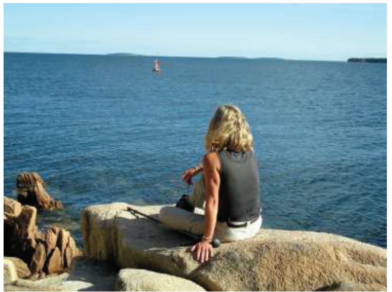
Falling in love with Maine...

(You may request a roommate, or we'll be happy to pair you With one of the other great women traveling solo.)