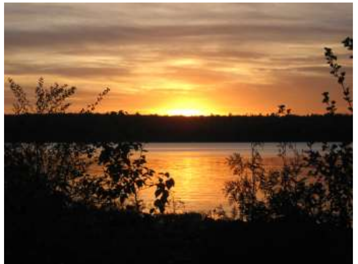
Sunset from near our Bayside bonfire