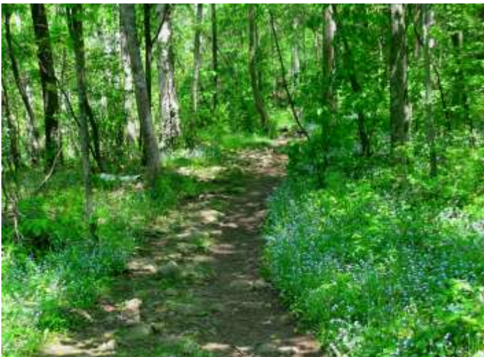
Hiking the Eagle Cliffs trail

Free time: Return to the hotel for an indoor swim and relaxation, or catch the sunset at Peninsula State Park.