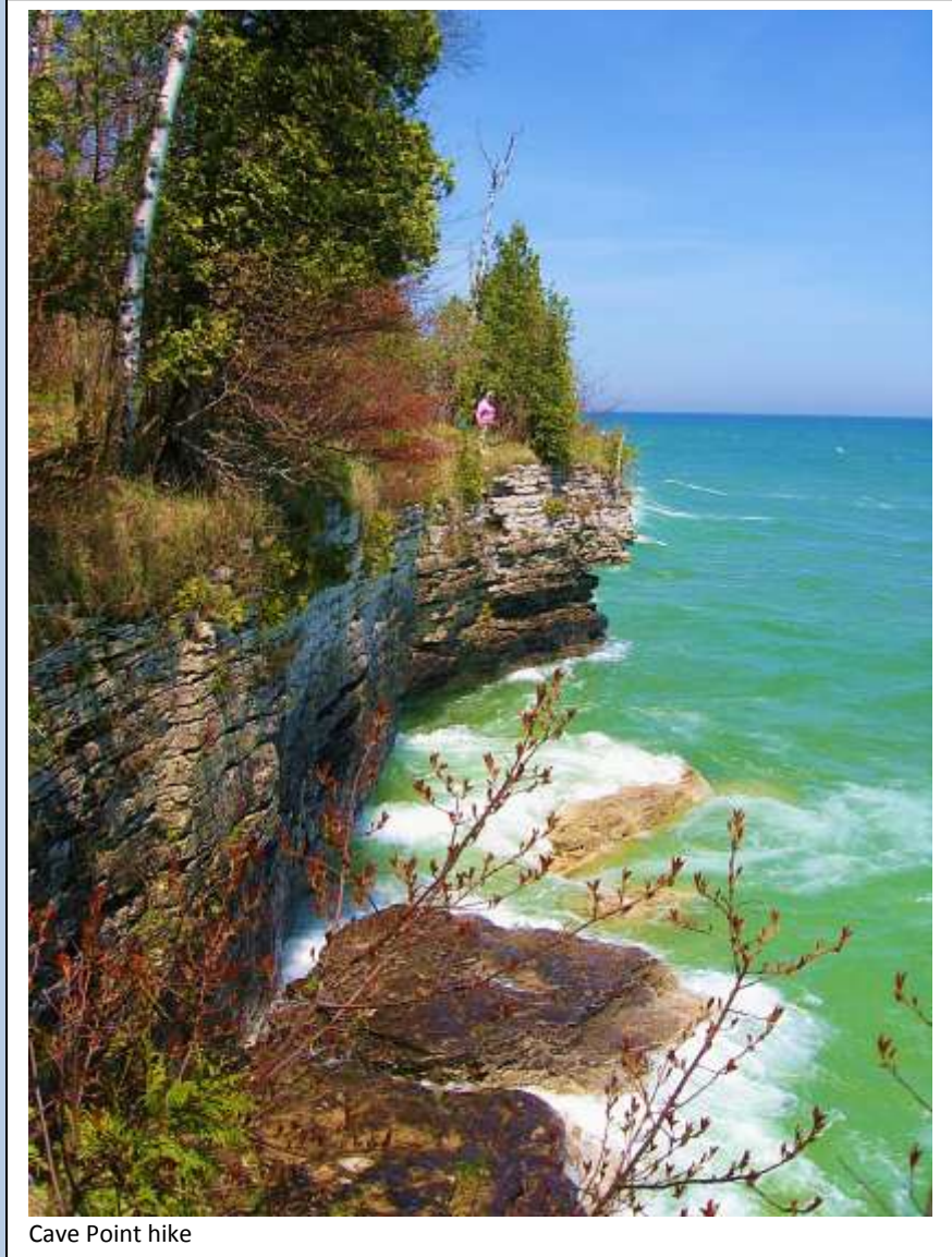
Cave Point hike