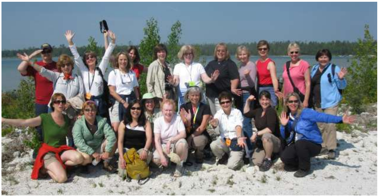
Life's a beach!