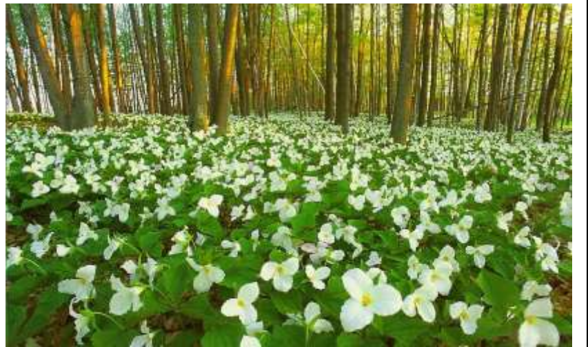
Door County's large-flowered trillium

Peninsula State Park: Check out of your room, and then meet at this pretty park on the Bay side of Door County. We'll hike the gorgeous 2-mile Eagle Cliff loop featuring some of Door Peninsula's most dramatic scenery: towering bluffs, cobblestone beaches, and sea caves. We'll allow time to sit along the Bay's peaceful waters, watch the water birds, and unwind. (Eat breakfast before our hike, and bring a trail snack. Park entrance requires a $10/car daily sticker.)