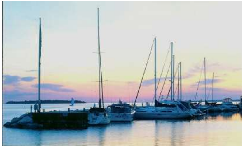
Fish Creek Harbor, Door County

10:15 am: Newport State Park: You'll love this park! Its 2,400 acres boast 11 miles of Lake Michigan shoreline, evergreen and hardwood forests, upland meadows, and wetlands. This is a new gem for those who have enjoyed previous Door County getaways with us. ( We'll eat our trail lunch at the park. Park entrance requires a $10/car daily sticker. )