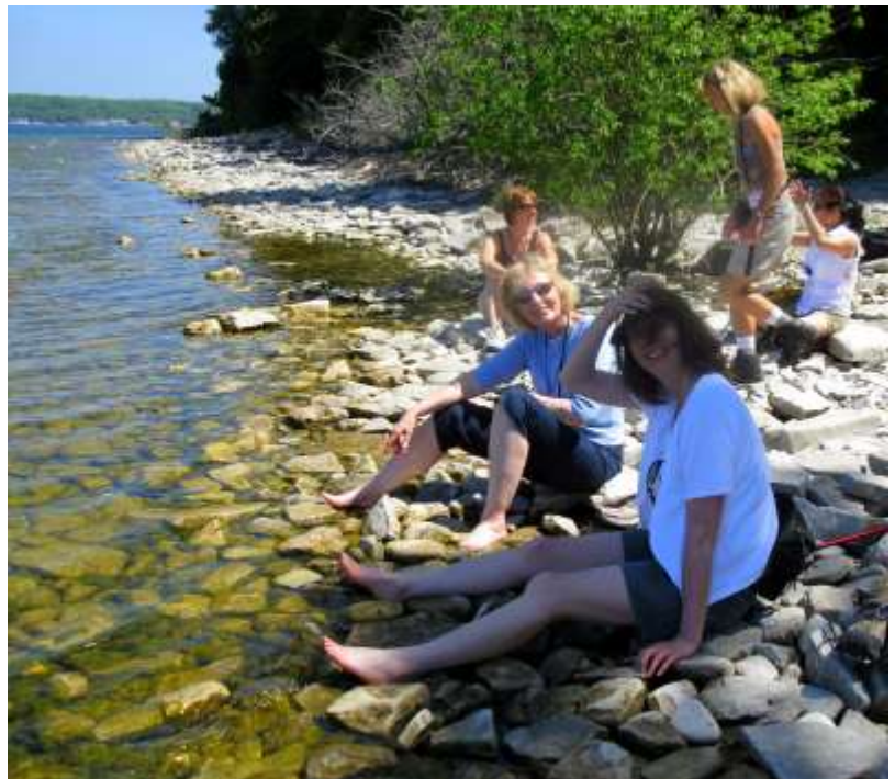
Taking a toe-dipping break during one of our hikes