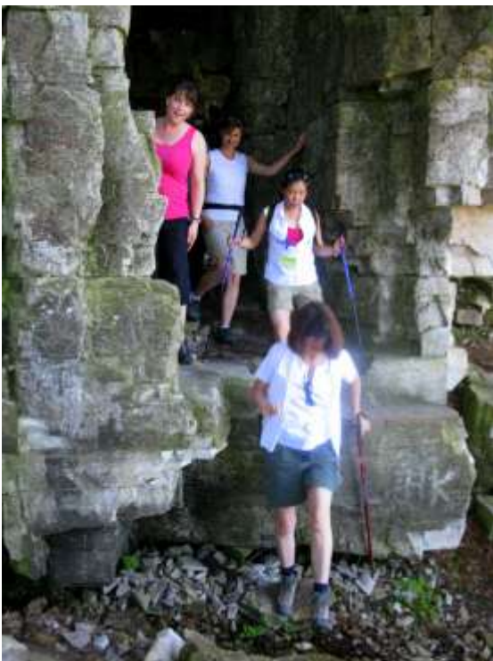
Exploring the sea caves along our trail

7:30 pm: Sunset bonfire: We'll bask in the warmth of a campfire and friendship as we enjoy s'mores and the sunset over the bay at Peninsula State Park. ( Your park sticker from Newport will admit you to Peninsula State Park. )