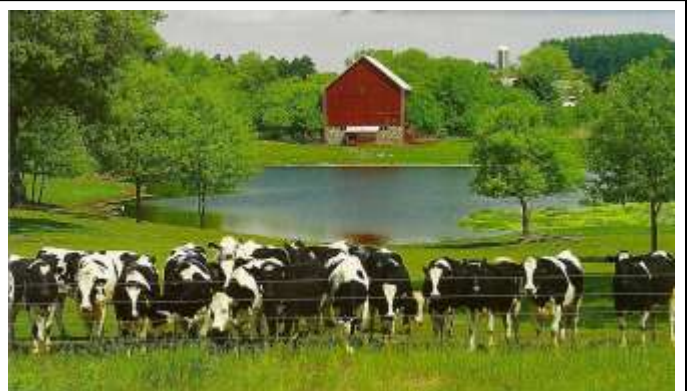
The dairy state's namesake

We have reserved the room block; you can simply put the room under your credit card when you check in. Note which suite you prefer on the registration form. Prices are based on double-occupancy in 1- and 2-bedroom suites and triple-occupancy in 3-bedroom suites. Add $12 per suite for each additional person.